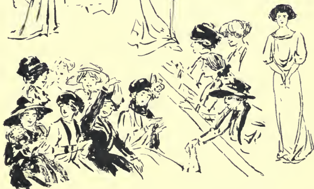
At the Albert Hall